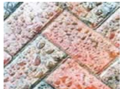
Water repellent helps stop spalling, discolouration and improves the life of the blocks.