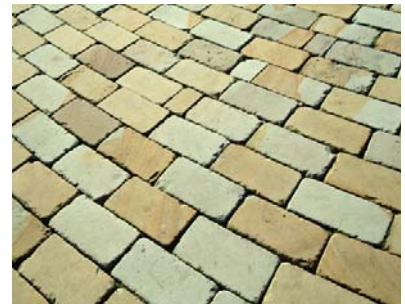
This picture shows how Spirit seal enhances the colour of pavers.

The Spirit Seal range is based on pure acrylic copolymers and other compounds suspended/ dissolved in xylene. When opening the containers or applying the sealer, extinguish all naked flames, wear solvent resistant gloves and goggles. Avoid breathing in the released vapours.