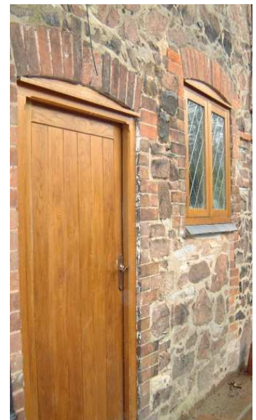
A Grade One listed building in Leicestershire treated with 4 Seasons both inside and out.

75 TOWN GREEN STREET ROTHLEY LEICESTER LE7 7NW TEL: 0116 230 1955 – FAX: 0116 230 1944 www.constructionchemicals.co.uk