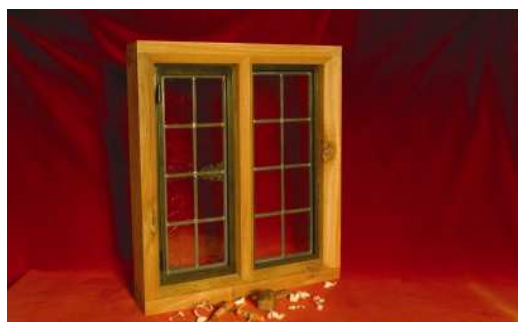
The Stamford window with 4 seasons Antique Oak finish. Brown and Jones of Oakham.